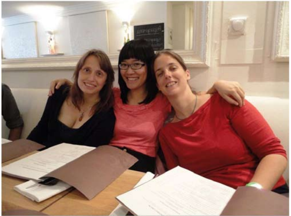
The Hivos Ladies

""To be without you, is like facebook without friends, myspace without bands, google with no results." "Your name must be Google, because you've got everything I've ever searched for." "Your homepage or mine?"